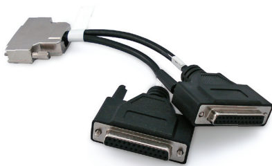
Dual Serial DB25 Octopus Cable Included.